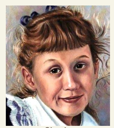
Shaala 14" x 11" Oil on canvas (detail)