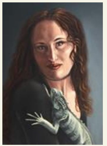
Joelene 36" x 24" Oil on canvas (detail)