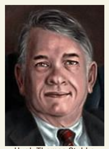
Hugh Thomas Stubbs 24" x 18" Oil on canvas (detail)